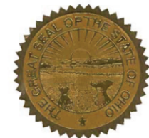
John R. Kasich Governor